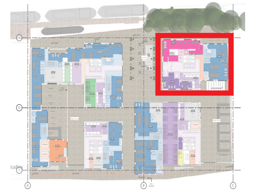
Extract flue location