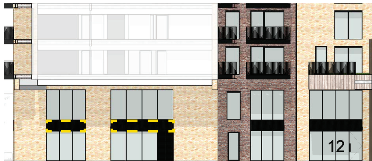
Potential location of louvres on less sensitive passage way linking Canal Yard to East Yard - GA Elevation