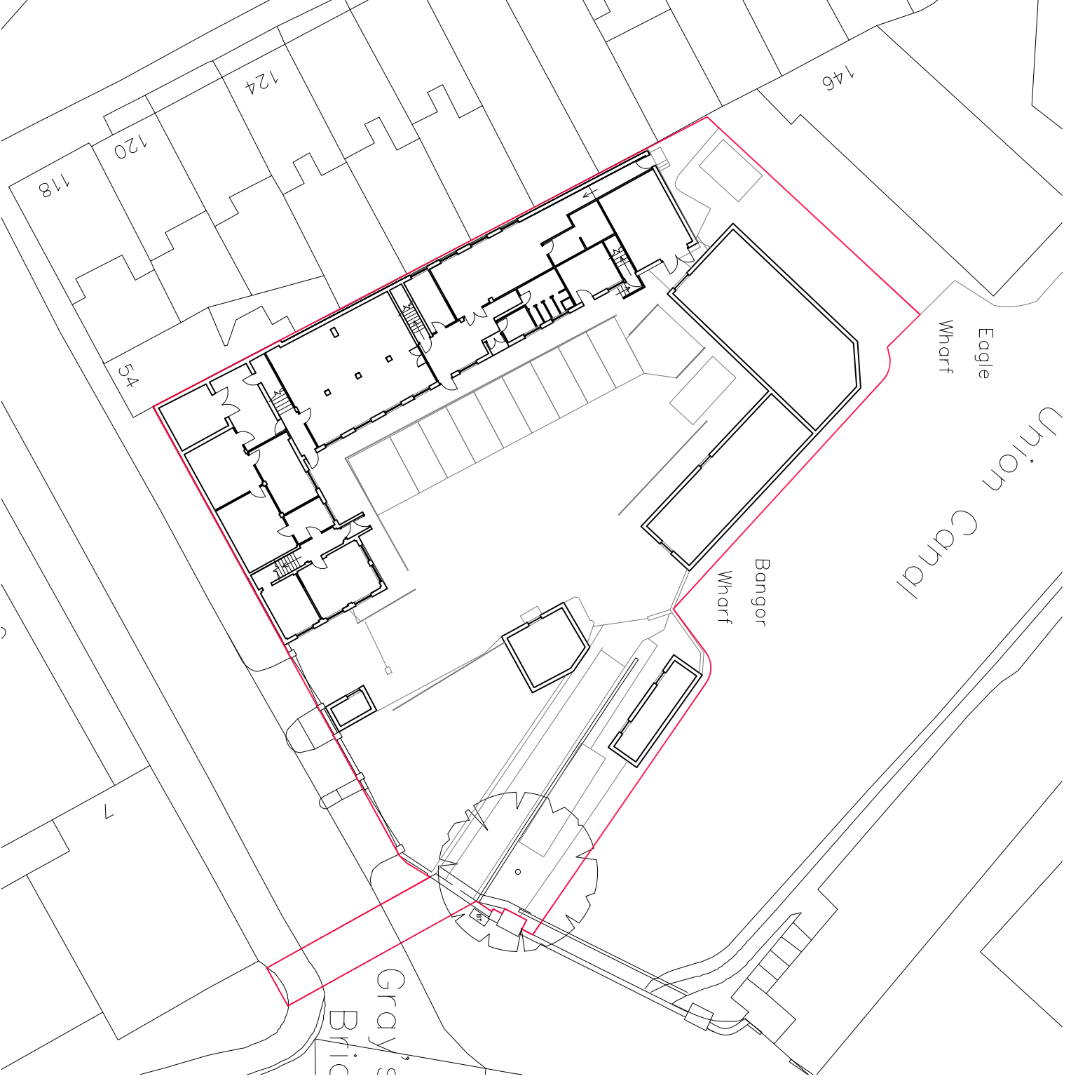
Existing Ground Floor Plan